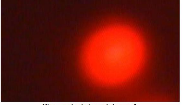
Microscopic photograph 1 score 0

The results obtained in this study indicated that the mutagenicity index of positive control was 53.5 % and the mutagenicity index for the lower dose of Supermint herbal medicine after 60 minutes was 4 % and the mutagenicity index of higher dose of the Supermint herbal medicine after 60 minutes was 6.5 %. These findings indicated that with the increase of the dose of the Supermint herbal medicine mutagenicity index was increased. However it was not significant as compared with positive control P<0.0001. Based on genotixicity study by comet assay the present study provided additional confirmation to our previous study, that high doses of Supermint herbal medicine did not produce significant DNA damage.