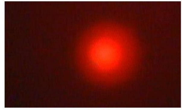
Microscopic photograph 2 score 1