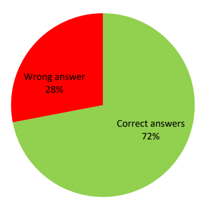
Figure 2. Percentage of correct answers regarding predatory journals

research in the life sciences. The HFSP Journal is indexed in several reputable databases, including PubMed Central, Web of Science, and Scopus, and its editorial board consists of experts in various fields of life sciences. The journal has a rigorous peer-review process in place to ensure the quality and validity of published research. Therefore, the HFSP Journal is a legitimate and reputable journal in the scientific community.