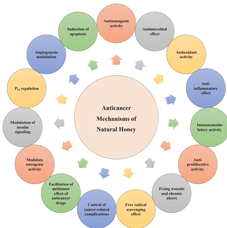
Figure 3. The main proposed anticancer mechanisms of natural honey.

During production, collection or processing, honey may be contaminated by microorganisms from bees, plants, and dust. 10 To warrant its high quality, prolong its shelf life, and maintain its freshness, honey is usually processed by heating or sterilizing. Heating leads to the formation