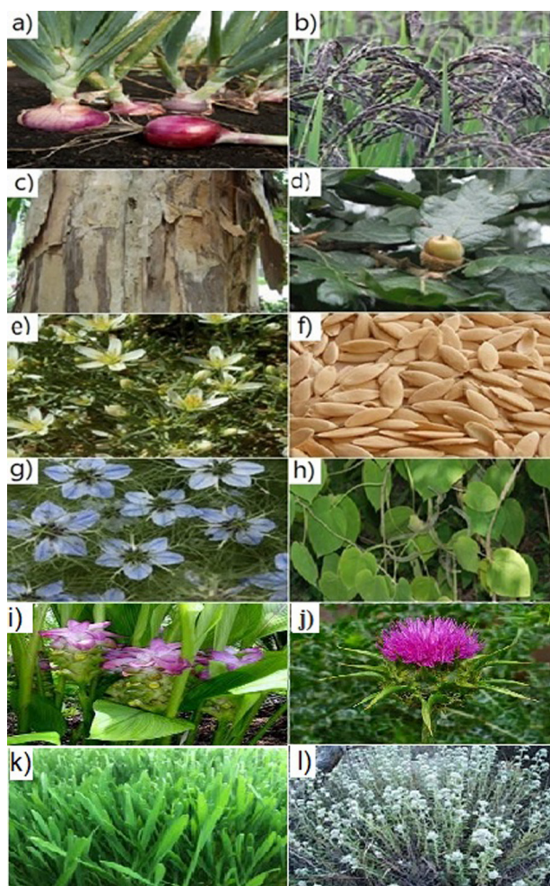
Figure 1. a) Allium ascalonicum , b) Black rice, c) Cinnamon, d) Oak, e) Peganum harmala , f) Cucumis melo seeds, g) Nigella sativa , h) Marsdenia tenacissima , i) Curcuma longa , j) Silybum marianum . k) Wheatgrass, l) Teucrium polium .

The Teucrium polium (Figure 1l) is a wild-growing flowering plant found in Europe and southwestern Asia. T. polium has been applied in Iranian traditional medicine for treating multitude of diseases due to its pharmacological properties. This plant has been reported to have hypolipidemic 62 hypoglycaemic 63 anti-nociceptive 64 anti-oxidant, anti-bacterial, anti-fungal, anti-septic, and anti-inflammatory 65 potentials. There has also been an anti-angiogenic feature of T. polium extract reported which is attributed to a decreased NO secretion by HUVECs. Aside from blocking NO secretion and proliferation inhibition, T. polium can also trigger apoptosis by increasing Bax (a pro-apoptotic factor) expression and decreasing Bcl-2 expression (an anti-apoptotic factor). 63 In 2019, Askari et al reported that the T. polium extract inhibited HUVEC cell growth in vitro and also VEGF secretion. These results show that T. polium could be a candidate for angiogenesis prevention. 66