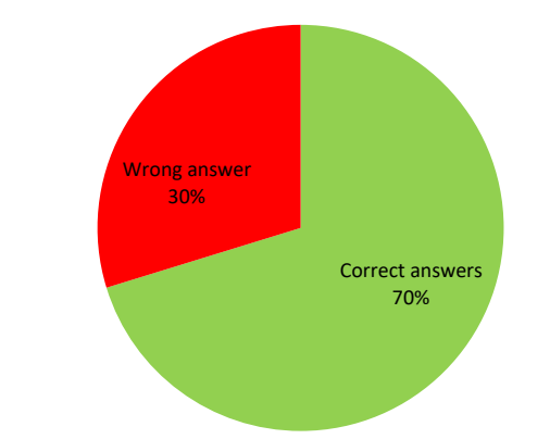
Figure 1. Percentage of correct answers regarding hijacked journals

Yes, the HFSP Journal is an authentic journal. It is an open-access, peer-reviewed scientific journal that publishes original research articles, reviews, and perspectives in the fields of life sciences and related disciplines. The journal is published by the Human Frontier Science Program (HFSP) Organization, which is an international organization that supports frontier