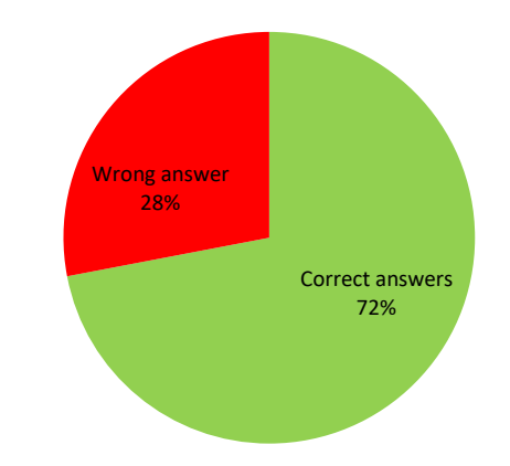
Figure 2. Percentage of correct answers regarding predatory journals

research in the life sciences. The HFSP Journal is indexed in several reputable databases, including PubMed Central, Web of Science, and Scopus, and its editorial board consists of experts in various fields of life sciences. The journal has a rigorous peer-review process in place to ensure the quality and validity of published research. Therefore, the HFSP Journal is a legitimate and reputable journal in the scientific community.